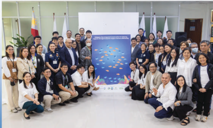
"Rising Together: Launching and Inception Event of the PRICELESS Project" held on February 3-4, 2026, at the Ninoy Aquino Parks and Wildlife Center

The PRICELESS Project brings together DENR–BMB, BFAR, local governments from of Regions II, III, IV-A and V, academic institutions, and conservation groups to align mandates, share resources, and strengthen enforcement in the PRMRR.