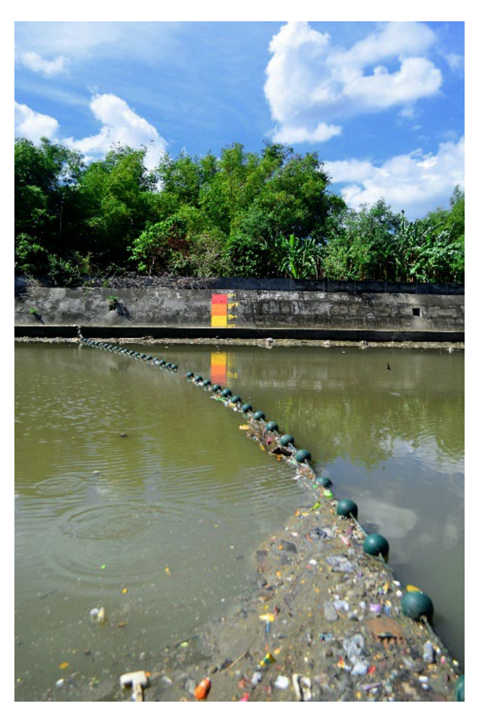
A trash boom helps trap and collect floating riverine debris in Bacoor.

Data relating to plastic waste generation was obtained by analyzing the 10-year Solid Waste Management (SWM) plans of the seven cities and municipalities located within boundaries of the river watershed: Tagaytay, Silang, Amadeo, Dasmariñas, Imus, Bacoor, and Kawit.