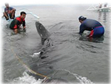
Calatagan Rescue Operation