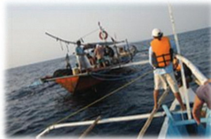
Nasugbu Bantay Dagat