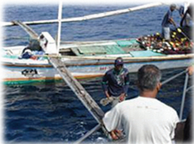
Calatagan Bantay Dagat

The Province of Batangas has now scaled up its ICM program from Batangas Bay to the entire coastline of the province. Central to this feat is the proactive involvement of the corporate sector.