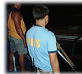
Mabini Bantay Dagat with local Philippine National Police

Photos of First Gen's support to the Province of Batangas.