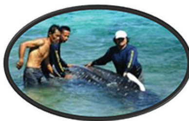
Mabini-Tingloy Joint Rescue Operation